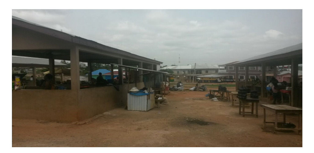
Figure 2: Community market at Onwe