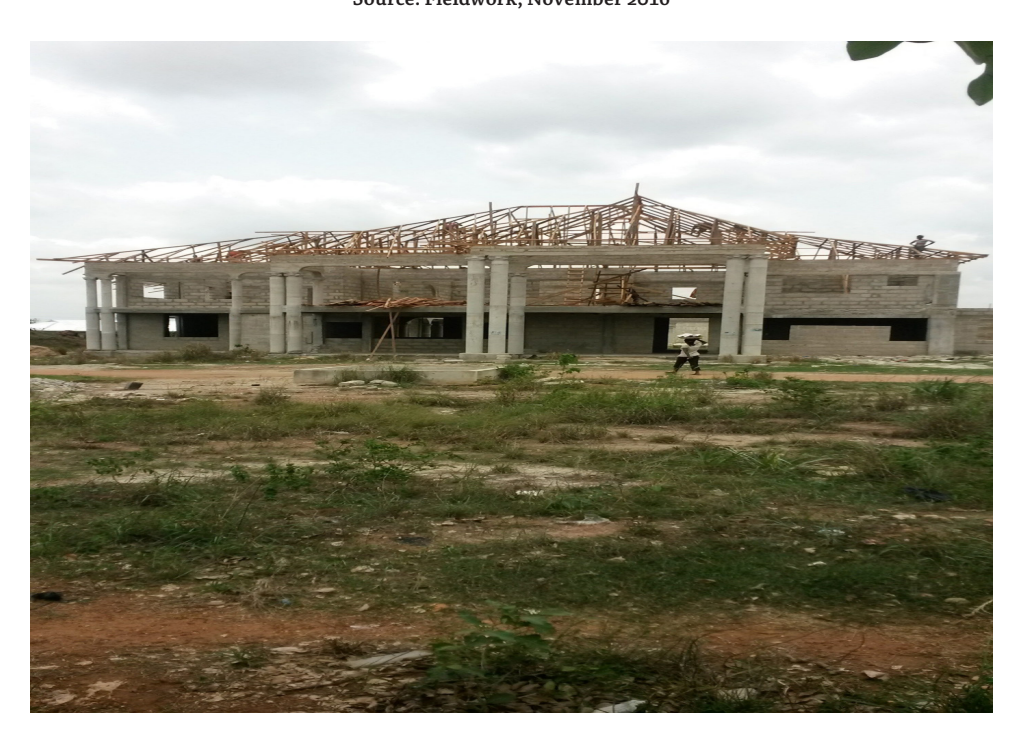
Figure 3: Chief's palace at Onwe under construction