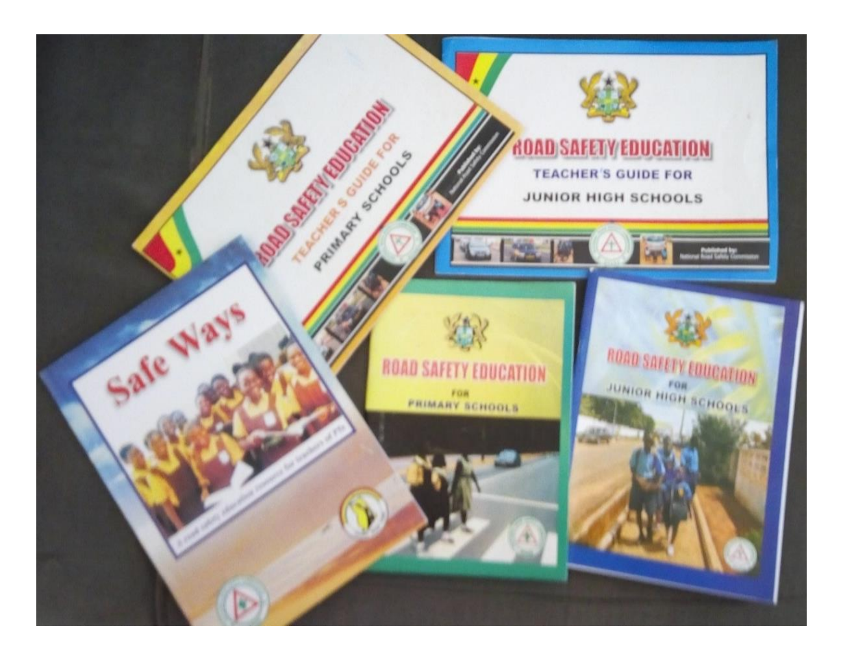
Figure 2: Road Safety textbooks and teaching manuals