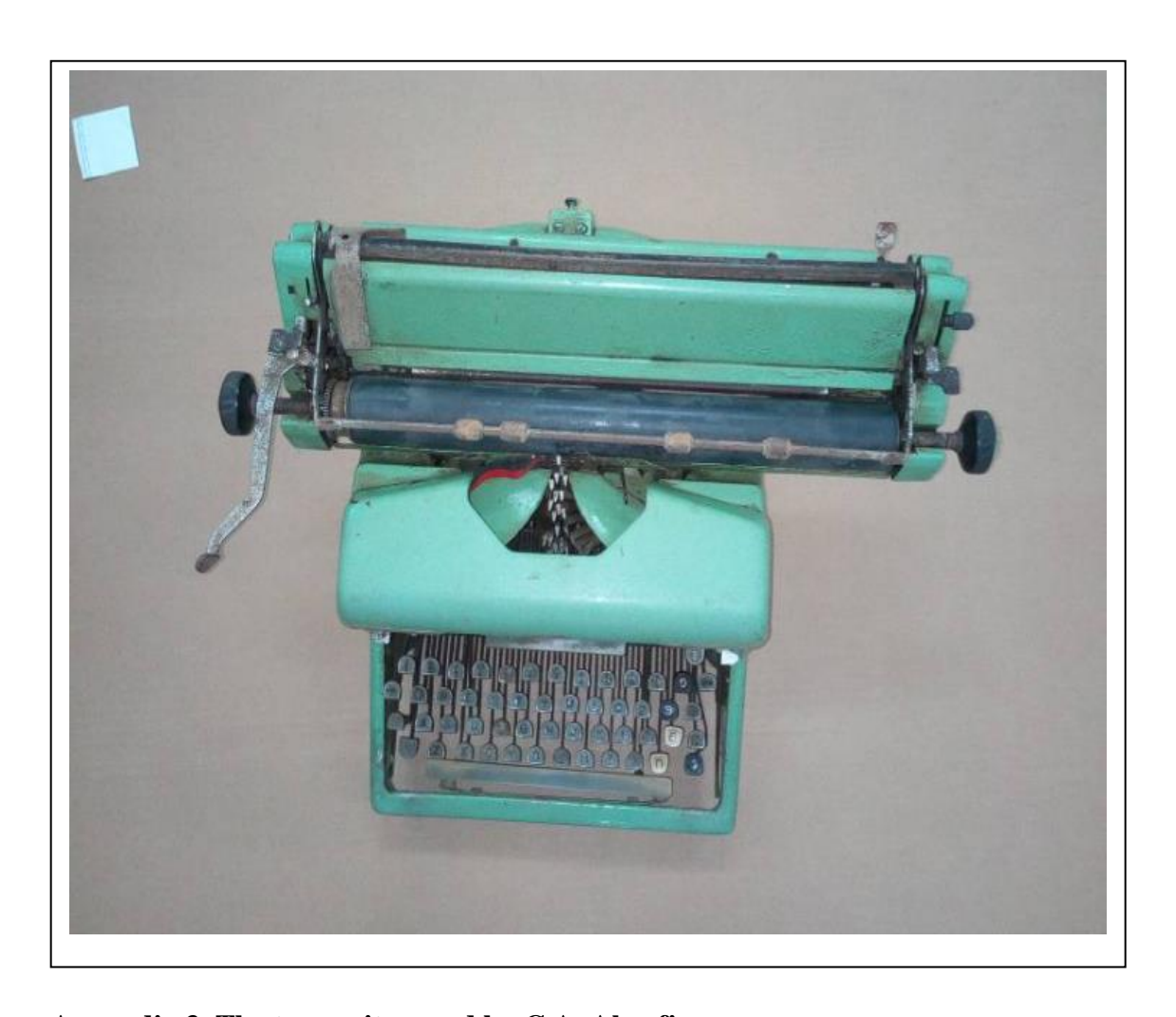
Appendix 3. The typewriter used by C.A. Akrofi