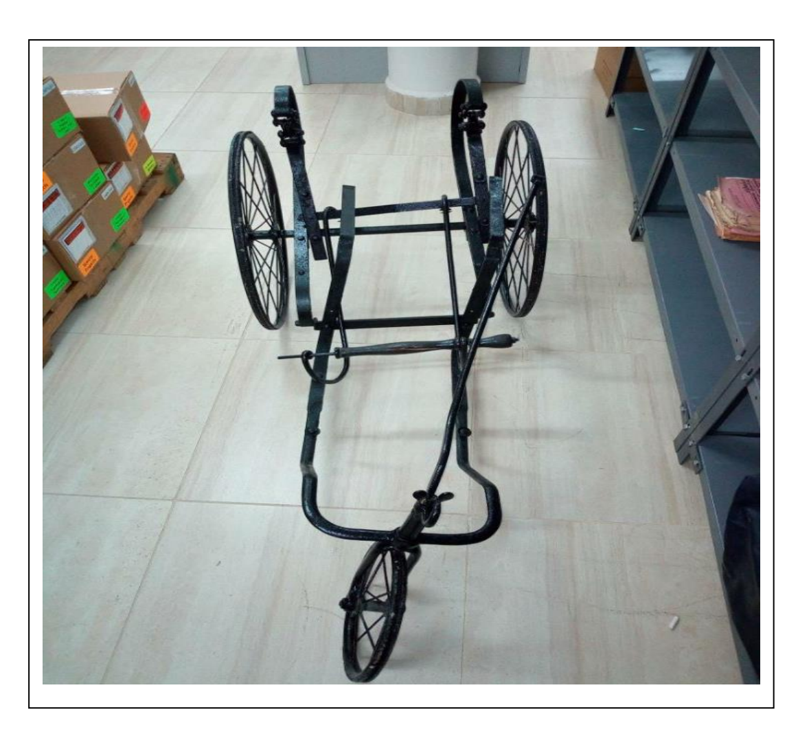
Appendix 2. A second wheelchair kept at the A.C.I. archives