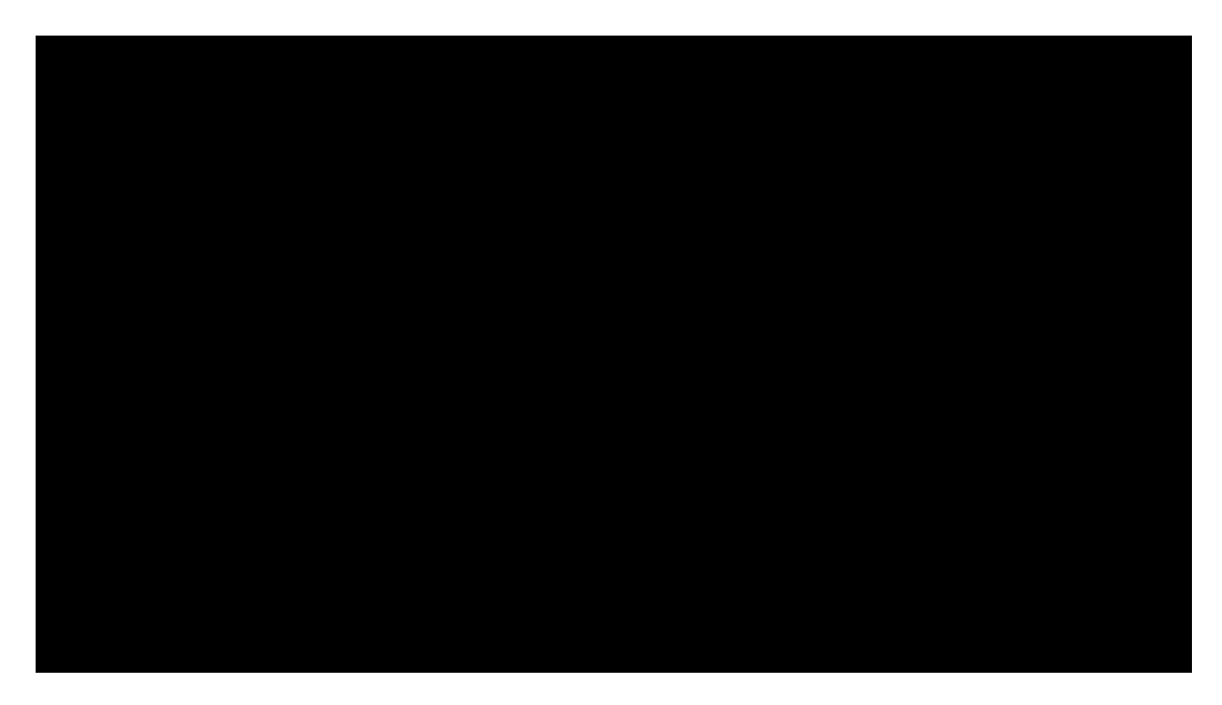
Figure 1: Effect of Microgynon on plasma urea (mmol/l)

<sup>abc</sup>.Different letters in a given row denote significant difference, P<0.05.