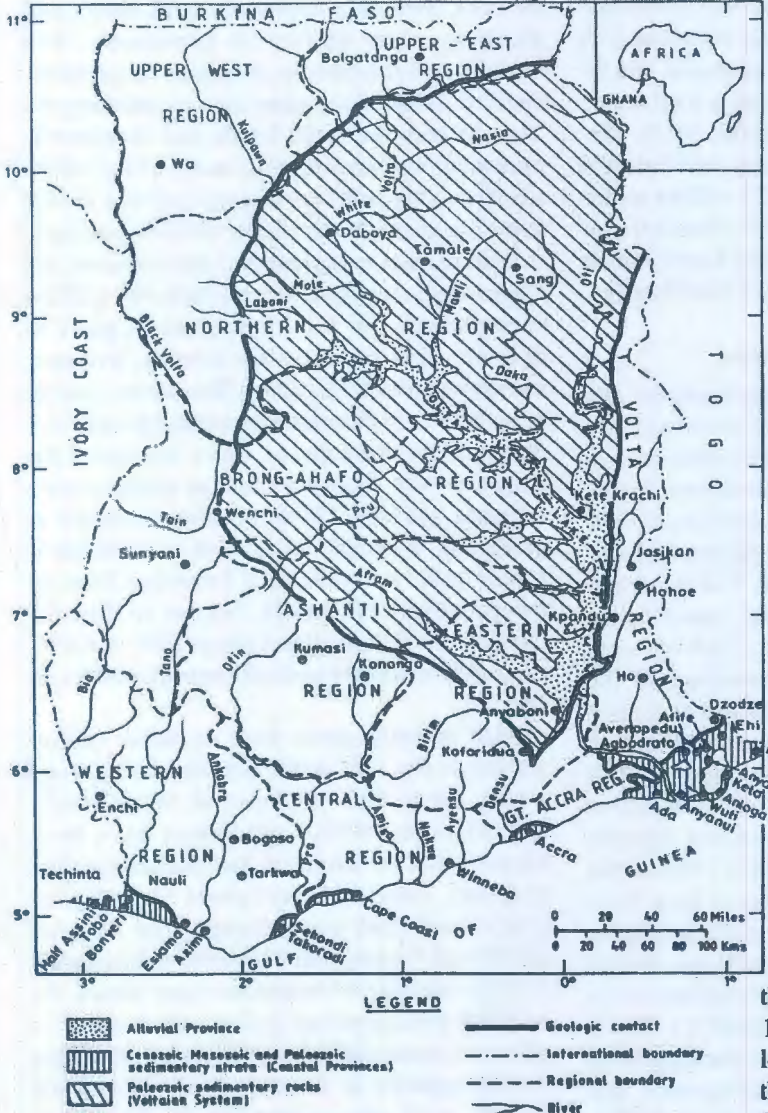
Fig. 2. Hydrogeological provinces (Geological Survey of Ghana, 1969)

this limestone aquifer is about 184 m<sup>3</sup>h<sup>-1</sup>. Falling groundwater levels have been observed in the upper regions where over 2,000 boreholes have been drilled since the mid-1970s in the