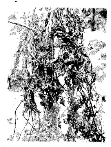
Fig. 1. Water yam plant sprayed with water (control).

control plants were dead (Fig. 1), while Benlatetreated plants were still fresh and green (Fig. 2). The percentage reduction in disease severity