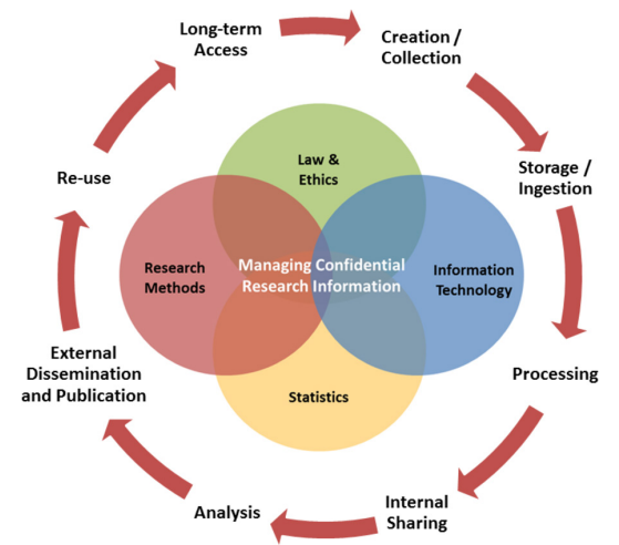
Fig. 1: Research Information Life cycle.

counts), and long-term access (ownership perspective in terms of where the document can be accessed from).