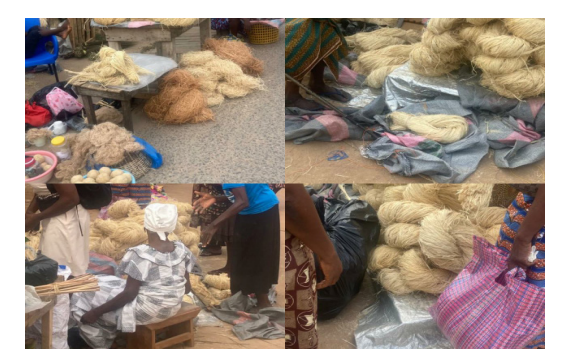
Fig. 1: Chewing sponges sold at Agbogbloshie in Accra

These pose a likely health hazard since chewing sticks and sponges are purchased and used for oral hygiene with no prior cleaning and treatment, justifying the need to investigate if there are any microbial contaminants that can affect overall health. This information will support the need for proper methods for storage and handling of chewing sticks and sponges. This study aims to assess the presence of selected diarrhoeal pathogens (Rotavirus A, E. coli, Salmonella and V. cholerae) on chewing sticks and chewing sponges sold as ready-to-use teeth cleaning agents on the Ghanaian market.