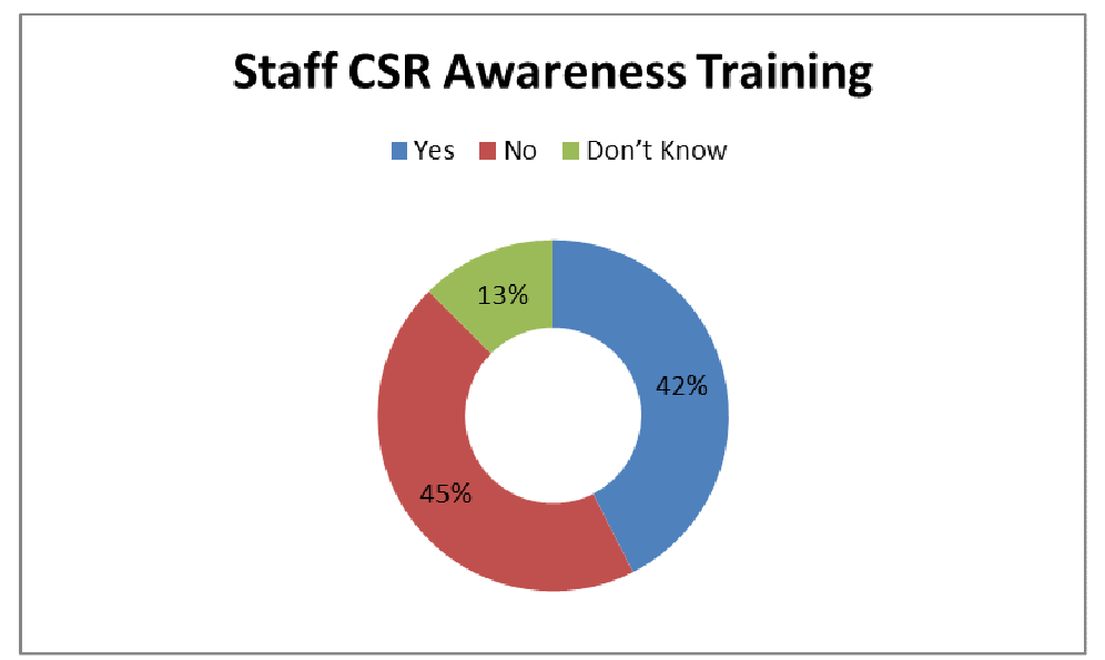
Fig. 4.1:

awareness programme; however, 45 percent claimed they have not attended such programmes and 13 percent were not sure (Figure 4.1).