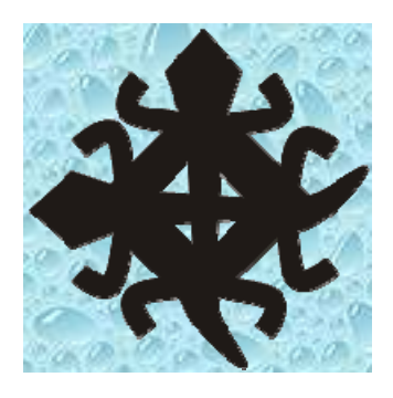
Fig. 1 Funtufunefu Symbol of Unity in Diversity

Perhaps, the first impact of globalization on culture is the unification that it brought among diverse cultures in Ghana. Globalization has brought in arguments for both homogeneity and heterogeneity. The arts now have a more diverse set of cultural values, institutions and opportunities. The set of aesthetic options available are increasingly the same as those options available to other countries. This is irrespective of the cultural level from which the arts are perceived and symbolic of unity in diversity which is deeply rooted in the traditional Adinkra symbol, Funtufunefu, literally meaning siamese crocodiles, in Fig. 1. According to Agbo (2006), it signifies the unification of people of different cultural backgrounds who are optimistic of common objectives and goals despite divergent views. It is the cementing of brotherliness and sisterliness among the people of a particular society or fraternity. According to Bodley (2009), anthropologists often use the term culture to refer to a society or group in which many or all people live or think in the same way. He cited four distinguishing characteristics which culture has as: symbolic; shared; learned; and adaptive.