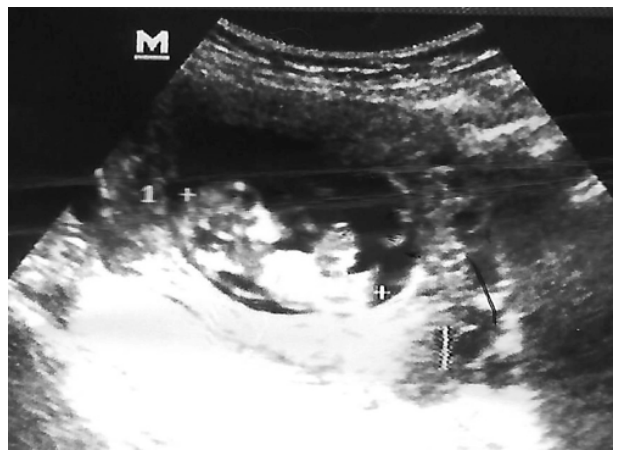
Figure 1 Scan at 10 weeks' gestation had demonstrating a midgut herniation suspicious of an omphalocoele

as part of preparations for delivery and subsequent resuscitation. They suggested we allow vaginal delivery because of the expected poor prognosis. Pregnancy and delivery was closely supervised.