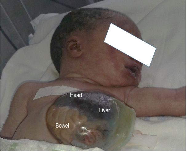
Figure 3 The defect covered by a transparent membranous layer

ectopia cordis). The defect was covered by a transparent membranous layer (Figure 3).