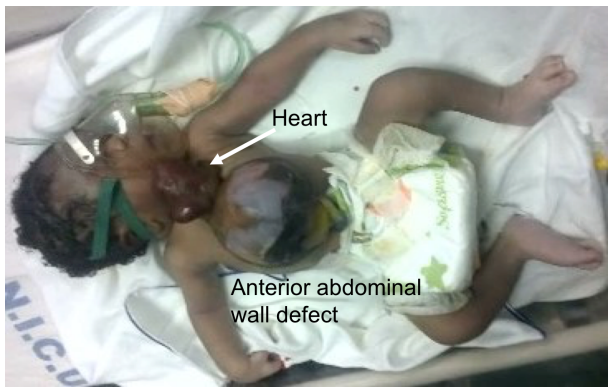
Figure 5 Complete Pentalogy of Cantrell

Physical examination showed a cyanosed baby with the pulsating heart completely outside the chest at the level of the neck continuous with an exomphalos major (>5cm). Oxygen saturation was 74% on oxygen. Lung fields were clinically clear. The sternum, the diaphragmatic portion of the pericardium and the anterior diaphragmatic wall were absent (Figure 5).