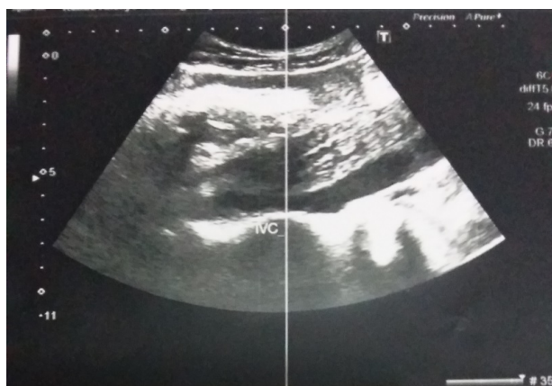
Figure 2a Ultrasonographic image of the patent Inferior vena cava

The post-operative period was uneventful. He received four units of blood in total within the first 12 hours on admission, one unit preoperatively and three units intraoperatively. He spent the first four postoperative days in the intensive care unit. On post-operative day two, we performed an abdominal ultrasound that revealed continuity of the IVC wall with no intraluminal thrombus (Figures 2a and 2b). The patient was anticoagulated with the low molecular weight heparin (LMWH), Enoxaparin (Clexane) 40mg daily for the first four days postoperatively and he was discharged on post-operative day 10. He has no postoperative complications eight months after surgery.