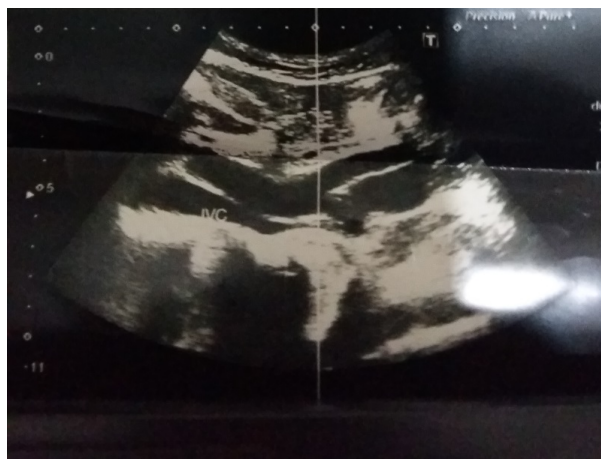
Figure 2b Ultrasonographic image of Inferior vena cava including proximal parts of common iliac veins