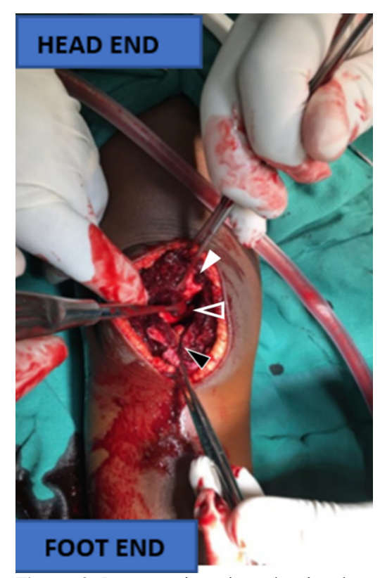
Figure 2 Intraoperative view showing bony patella (closed white arrowhead), gap between bony patella (open arrowhead) and inferior patella sleeve (closed black arrowhead).

At three months, patient was bearing weight and had started performing basic activities of daily living on her own. Plain x-ray of the knee in the lateral view showed complete healing of the avulsion fracture, characterized by complete obliteration of the fracture line (Figure 3C).