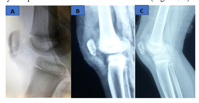
Figure 3 A- Intraoperative fluoroscopic view; B- Immediate post-operative view; C- 3 Months post op, showing complete healing of sleeve fracture

At three months, patient was bearing weight and had started performing basic activities of daily living on her own. Plain x-ray of the knee in the lateral view showed complete healing of the avulsion fracture, characterized by complete obliteration of the fracture line (Figure 3C).