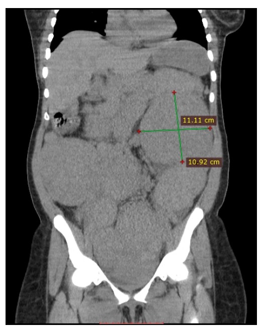
Figure 5 Coronal reformatted abdominal CT scan Images showing multiple isodense round and oval-shaped lesions in the peritoneal cavity after GNRH therapy