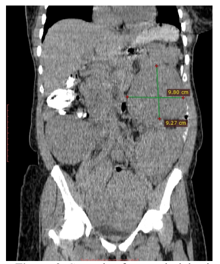
Figure 2 Coronal reformatted abdominal CT scan Image showing multiple isodense round and oval-shaped lesions in the peritoneal cavity before GNRH therapy

About a year later, the abdominal distension and discomfort recurred. The patient's abdomen felt firm and nodular. She had not lost weight. This time the patient was sent for an abdominopelvic computed tomography (CT) scan, which revealed numerous ovoid isodense enhancing lesions distributed diffusely in the peritoneal cavity (Figure 2).