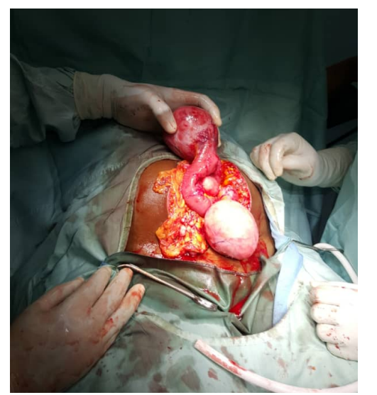
Figure 1 Leiomyomata attached to bowel and omentum during surgery

on the broad ligaments bilaterally. However, the uterus, which was almost the same size as previously, was fixed due to previous surgery; thus, it was difficult to free it completely to assess its size fully. The nodules were again removed.