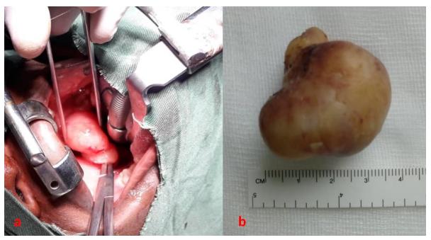
Figure 2 Intraoperative view with lesion pedicle clamped with hemostasis forceps (a), surgical specimen (b).