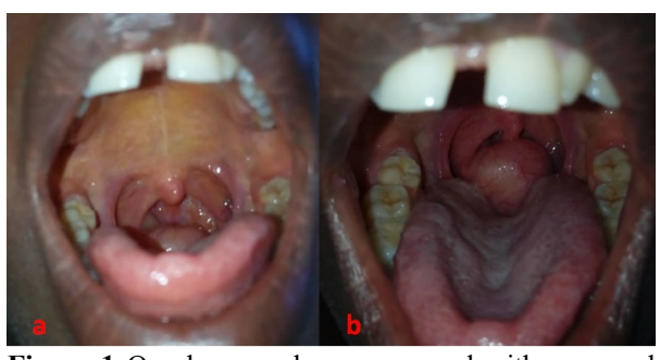
Figure 1 Oropharyngeal mass covered with a normal-looking mucosa (a) arising from the right lateral oropharynx and ascending to the protraction of the tongue (b).

The surgical specimen measured 4cm x3cm x 3cm (figure 2b).