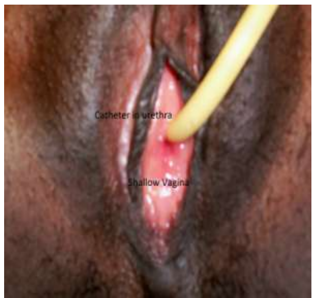
Figure 2 Vulval appearance of patient before 1<sup>st</sup> surgery.

The vaginal pack was removed after 24 hours and replaced with a male condom filled with gauze to keep the vagina patent. This was changed every other day for two weeks. Daily vaginal dilatation with metal bogies was started in the 3<sup>rd</sup> week. Vaginal examination at 4 weeks showed a patent vagina that admitted 2 fingers freely and to a depth of 6.0cm. The need for regular vaginal dilatation was stressed to the patient who was taught self-dilatation and discharged home.