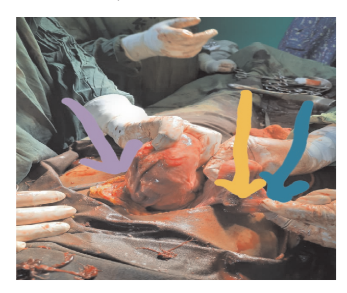
Figure 2 : Left unicornuate uterus with Fallopian tube depicted with a gray arrow; a right rudimentary horn with Fallopian tube and ovary depicted with green and purple arrows respectively.

need for early booking for antenatal care in the next pregnancy. She was told to come when ready for excision of the rudimentary horn.