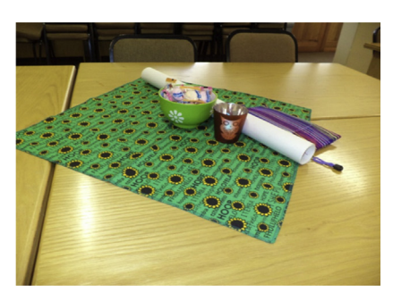
Photo 1 - World Café data collection set-up (Froneman, 2013 and Koen, Du Plessis, & Koen, 2012).