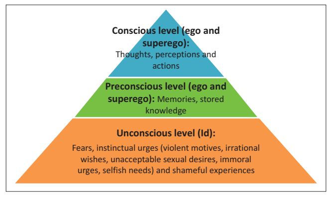
FIGURE 1: Freud's view of psychic determinism relating to levels of consciousness and the structure of the psyche.

To understand the unconscious motivations of human behaviour, we turn to Sigmund Freud's psychoanalytical theory, departing from psychic determinism, meaning conscious behaviour and thoughts result from unconscious psychic factors and are thus intentional (Brenner 2007:15; Lothane 2006:287) contra Descartes, as 'mental' does not equal 'conscious' (Lothane 2006:286) and the structure of the psyche (id, ego and superego driven to action by psychic energy in the form of wishes or instincts) (English 2008:240) (see Figure 1).