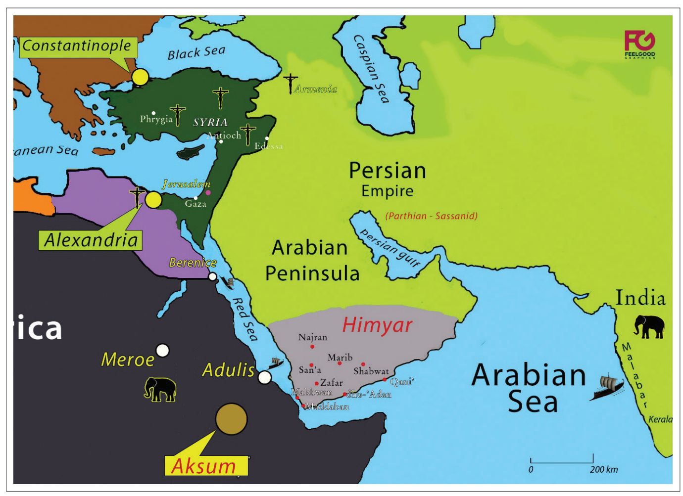
Source: Adapted from Bowersock, G.W., 2013, The throne of adulis: Red Sea wars on the eve of Islam, Oxford University Press, New York, NY. FIGURE 2: Map illustrating area under discussion, is a zoomed excerpt.

Ethiopia as a notable participant of the 1st and 2nd century global polities. The development and spread of Christianity can be explicitly traced therefore in perspective of the cosmopolitan nature of the Adulis port. It can therefore be inferred that Christianity could make its way from the orient into Ethiopia via the sea.