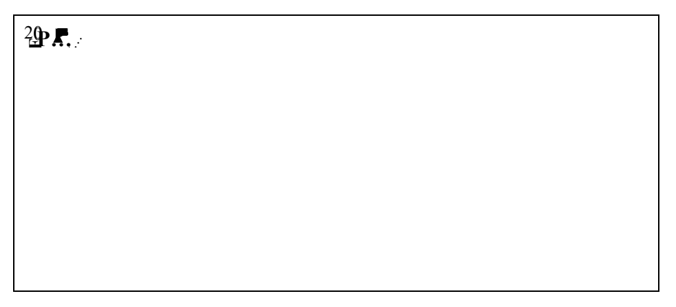
Figure 2: Learning Activities Observed in Form Three PE Lessons

prevalent learning activities performed in PE lessons. In all the lessons observed in the classroom, each of the learning activities was counted and its frequencies were computed. The results were as shown in Figure 2.