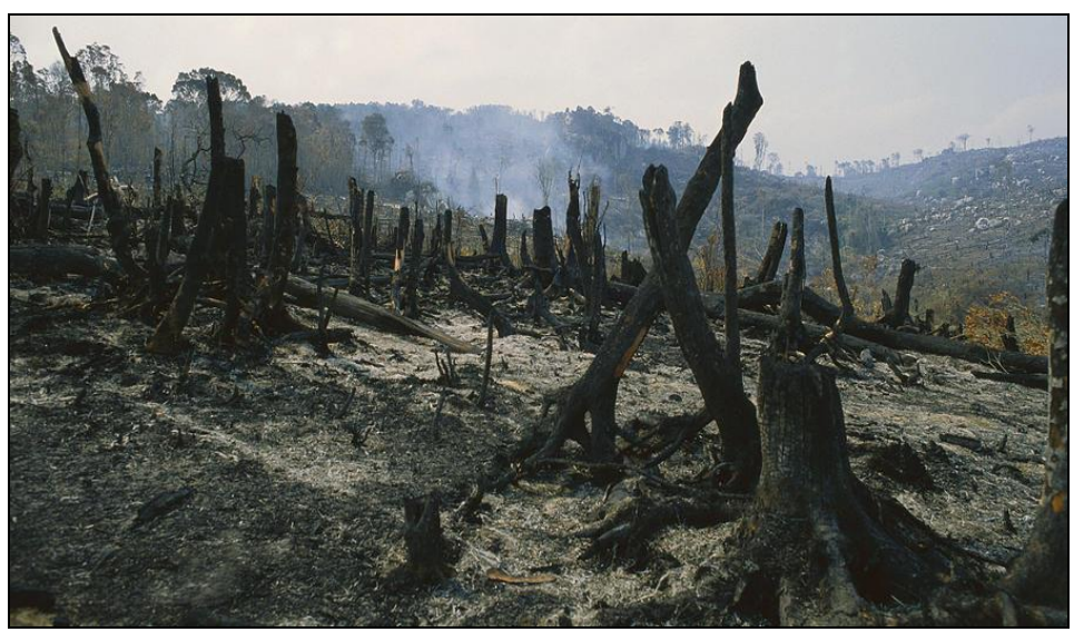
Figure 1: Forest Compartment Affected by Escaped Fire during Land Preparations