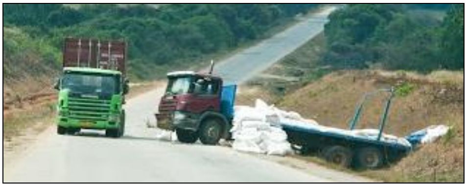
Figure 5: Combustion from Moving Vehicles can Result into Forest Fires when fire sparks get contact with dry grasses

In forest stands passed by the Tanzania to Zambia highway there are cases where forest fires have been resulting from combustion or ignition from vehicles (Figure 5). This includes combustion from vehicles and other machinery especially those employed in road construction, timber processing and heavy trucks used in loading and unloading of logs.