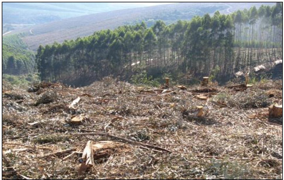
Figure 2: Poorly Handled Tree wastes Left after Harvesting Operation

As suggested from the quotation above, the dry season is also the peak of harvesting season. Activities like logging and timber processing result into accumulation of wood wastes which could become dangerous during dry season (Figure 2). It has been estimated that in order to produce 45 tons of timber, 55 tons of waste is created in the form of sawdust, treetops and branches, and is left to decay, burnt on site or collected as wood fuel, hence creating a potential danger to the forest plantation if left unmanaged.