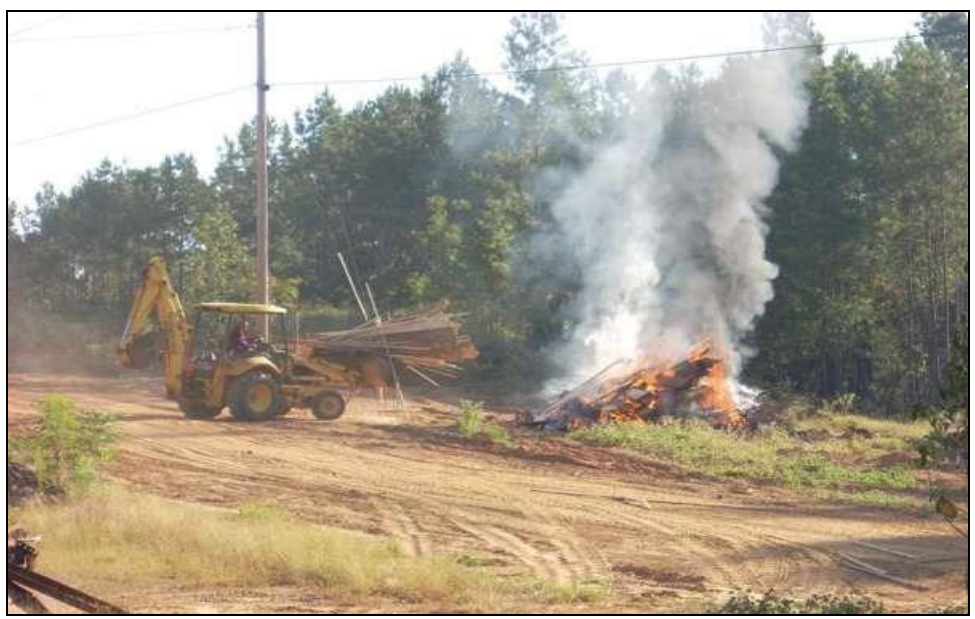
Figure 3: Burning of slabs near Forest Stand can Facilitate Forest Fire if done without Precautions