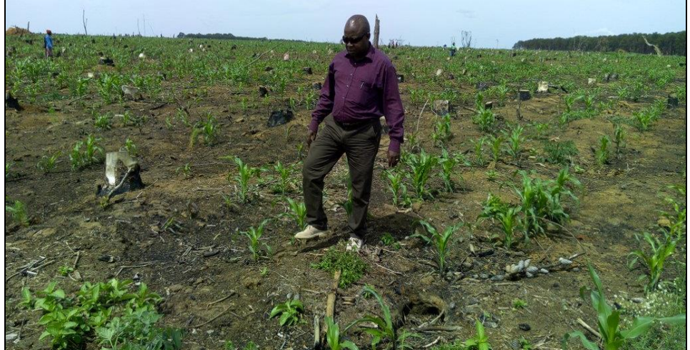
Figure 8: Farmers are allowed to Cultivate Maize in Trees Harvested Areas through Participatory Approach Communities

"We initially thought that PFM could address the dilemma. However, it is against all odds. Apart from continuing incorporating PFM principles, we are also using the special security guards to protect the forest because there are community members who do not adhere to principles" (July, 2018).