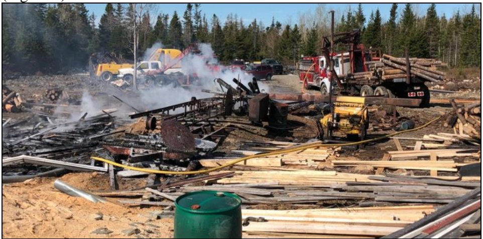
Figure 4: Fire caused by Sparks from Machines that make Forest Stands Prone to fire Incidences

Accidental causes of forest fires include failure of electric lines, sparks emitted by vehicles. This is especially dangerous in mobile sawmills which operate inside the forest stands in situation whereby the terrain is too difficult to justify pulling the logs out of felling site. During field survey the researchers witnessed the sparks from operating machines, which caused escaping fire by wind force to the nearest forest leftovers (Figure 4).