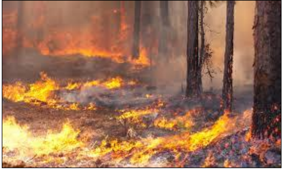
Figure 6: Forest Fires Destroy Planted Trees and General Ecosystem

Forest fire is ecologically and economically destructive at SHFP, and the loss of trees was the top ranked impact (77.8% of the respondents) followed by destruction of assets like houses, saw milling machines and vehicles. Forest fires suppress the re-growth of more resistant species and prevent woodland canopy which suppress herbaceous production and reduce fuel loads. Furthermore, fires slow down ecological regeneration capacity and impact the future extension strategies. Forest fires destroy land structure and make the area prone to soil degradation (Thompson et al 2013; Sebata, 2017 and Neary & Leonard, 2020). Fires destroy soil, microbes, pollinating insects and wild animals that support biological functioning that finally affect regeneration (Figure 6).