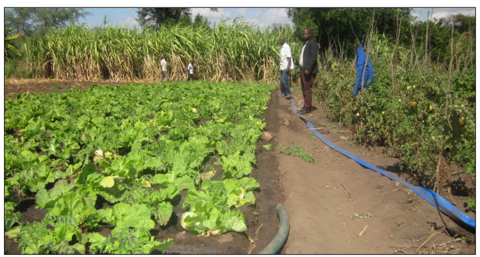
Plate 1: Small scale Irrigation activity in Ndindi, Chipoka Extension Planning area Source: Study field study 2018

Since drought is the most climate change challenge for smallholder farmers' food production in the study area, irrigation would be robust climate smart agricultural (CSA) technology to be deployed. There is need for government and other development agencies to support smallholder farmers with necessary irrigation infrastructure. According to (Turral et al. , 2011), adaptation measures need to build upon improved land and water management practices to boost resilience to climate change. Rural farmers' adaptation responses will need the water variable in agriculture irrigation and the competing demands from other users. Freshwater availability is relevant to almost all socioeconomic and environmental impacts of climate and demographic change and their implications for sustainability (Elliott et al. , 2014).