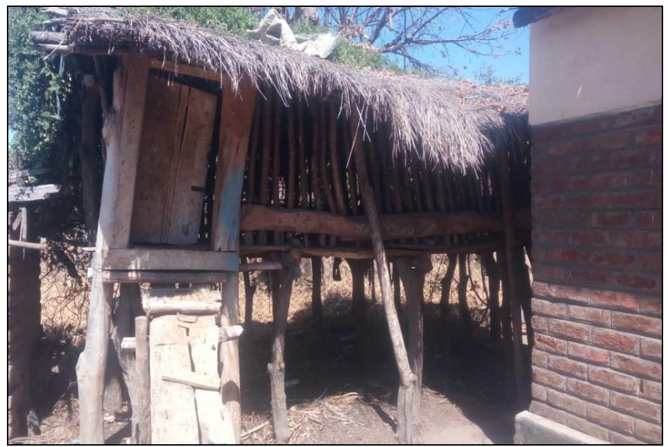
Plate 2: Indigenous Goats' local flood shelter in Chimoga village

FGDs also mentioned that smallholder farmers still practiced indigenous knowledge in livestock production management in face the disasters. It was mentioned that there were traditional methods of treating animals effectively using some herbs to treat many diseases. This can be called ethnoveterinary medicine (EVM) which considers traditional practices of veterinary medicine. For example, herbs like aloe Vera were used on many livestock species like chicken, cattle, pigs and goats. It was argued that livestock farmers have knowledge on many aspects of animal health including administering right herbal dosage. FGDs participants also revealed that they knew indigenous ways of preparing and preserving animal feeds when droughts ravage pastures. Most farmers preserve maize stalk after harvesting as supplementary feed for the dry season when grass will be dry and insufficient. There was also expressed knowledge of caring for animals to mitigate the impact of flooding. For example, during flooding animals such goats and chicken are sheltered in off ground/ raised pens (Plate 2). It was mentioned that smallholder farmers ensure that the kraal for goats is properly off the ground and roofed since goats are easily affected by rain and die if they are continuously exposed to damp conditions.