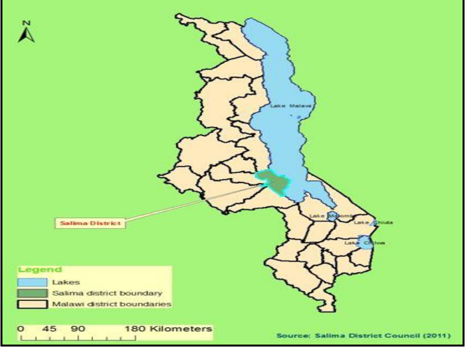
Figure 1: Map of Malawi Showing Salima District

highest temperatures are experienced in October reaching as high as 33°C while the lowest temperatures are experienced between May and July reaching 12°C. The area has three seasons throughout the year: Hot dry season (August- October), Hot wet season (November- April), and Cool dry season (May- July). Vegetation in the area is composed of savannah woodlands characterized by grasslands with scattered trees. There are no evergreen forests in the area due to dryness of the land during the hot and cool dry seasons.