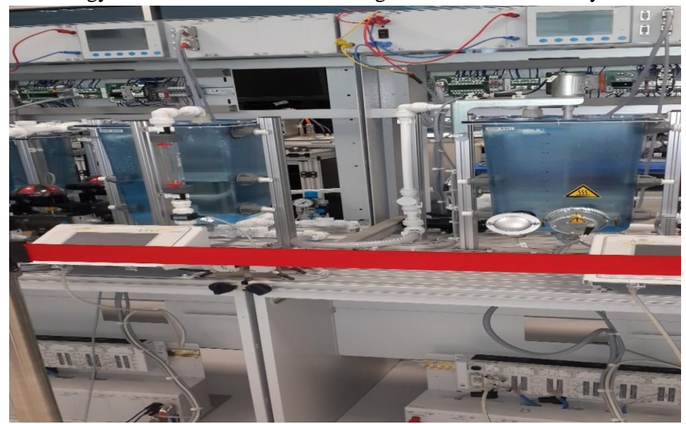
Plate 1: An Automatic Machine in a Mechatronics Workshop in Singapore

The results in Table 3 show variations in terms of the adequacy of teaching and learning infrastructure among the three countries involved in the study. While majority of respondents from Tanzania found the infrastructure to be inadequate, almost all respondents from the two Asian Tiger Nations found their infrastructure sufficient and up-to-date. The modernity of teaching infrastructure in the Asian Tiger Nations was confirmed through observations as part of this study. Plate 1 shows technology found at one of the ITE colleges involved in the study.