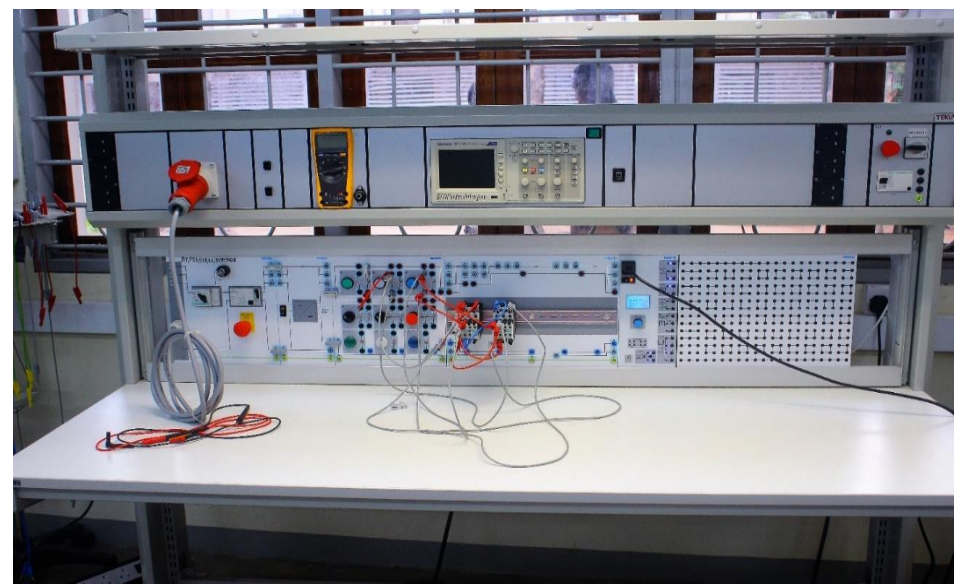
Plate 2: Semi-automatic machine in an Electrical Workshop at one of the VET Centres in Tanzania