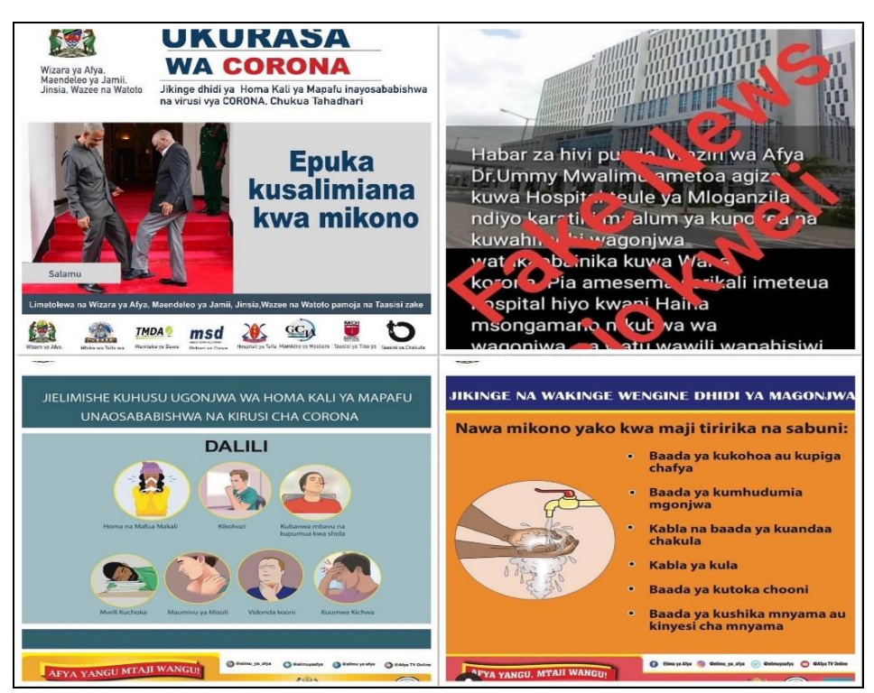
Figure 1: Excerpts from the Ministry of Health Instagram account

To proactively collect information on the ongoing pandemic, the Ministry provided health emergency numbers that citizens could freely use to update the government on individuals affected by the virus – 0800110125/0800110124/0800110037, of which the numbers were later changed to 199. In regards to travellers, the Ministry developed a Travellers' Health Surveillance System (www.afyamsafiri.moh.go.tz). The system was developed for travellers wishing to enter Tanzania to have quick access to Covid-19 services including online payment to Covid-19 test, online results to the tests, as well travel guides provided by the Ministry.