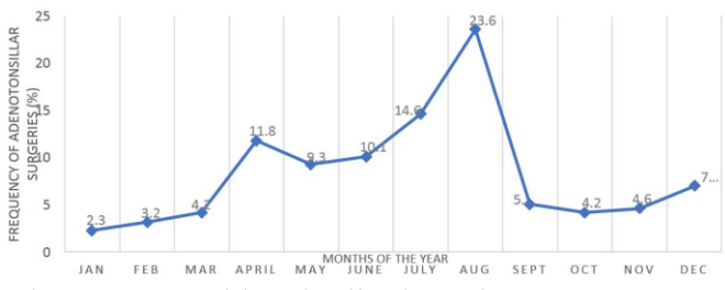
Figure 3: Monthly Distribution of Adenotonsillar Surgeries

(79.5%) followed by persistent nasal discharge (65.6%) and recurrent sore throat (58.9%). The least of the presenting complaint was fish bone impaction (2.7%).