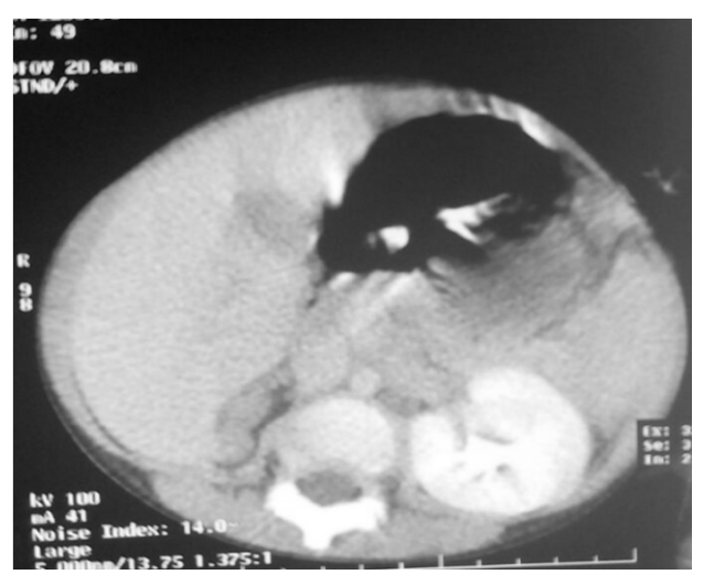
Figure 3: Axial contrast enhanced computed tomography of the abdomen showing absence of right kidney from the renal bed and a well enhanced left kidney

cannon ball opacities (figure 1). A diagnosis of nephroblastoma with lung metastasis was made. She was then planned for pre-surgical neo-adjuvant chemotherapy, right nephrectomy and post-surgical chemotherapy. Histological examination of the nephrectomy specimen confirmed the diagnosis of nephroblastoma. She was then monitored with 3monthly serial chest radiographs for about one year during which the chest lesions reduced in size and