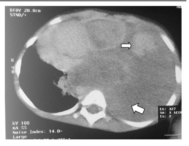
Figure 2: Axial contrast enhanced computed tomography of the chest showing massive left pleural effusion ( large white arrow ) and cannon ball densites (small white arrow) with mediastinal shift to the contralateral side and normal right lung field