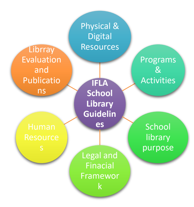
Figure 1: IFLA School Guidelines Categories.

improve school library programs; enhance the teaching and learning environment. As shown in Figure 1, IFLA school library guidelines covers all the necessary areas that need to be well managed in order to achieve the goals of the school library and ensure that it supports the school curriculum.