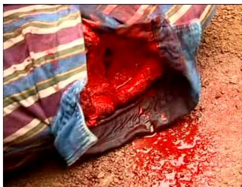
Isakaba Kills a Cripple Who Gives Arms to Robbers