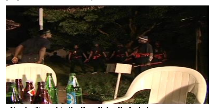
Nwoke Traced to the Beer Palor By Isakaba

Finally, Isakaba hunts Nwoke out as they trace him to a beer parlor. They overpower him and punish him for his evil deeds. Isakaba restores sanity to the society and the people moved about once again without molestation.