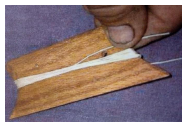
Fig. 2: Preparing the Heddle

Inkle looms heddles arrangements are unlike the continuous heddle of the Navajos loom, heddles are made individually. Heddles are made from good quality upholstery yarn that is thick, strong, medium-weight, durable and easy to manipulate. Since warp threads are stretched on a loom to provide the tension necessary for weaving, the yarns should be strong, both to keep a steady tension and to withstand constant beating during weaving Warp yarns should be flexible enough to reduce breakage and not so elastic as to sag and ruin the shed while weaving as such, furry or hairy yarns should be avoided. Yarns that will allow warp threads to move smoothly like wax linen, cotton, rayon and nylon should be use.