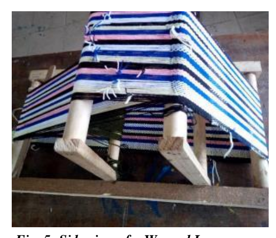
Fig. 5: Side view of a Warped Loom

The Weaving Process: To start weaving, wind weft yarn in a figure 8 onto stick or rule shuttle. This warping arrangement has offered imminent design possibilities always because twice the length of the loom can be woven. The weaving starts front of the loom to the back. The weft yarns inside the shuttle insert the tensioned warp from selvedge to selvedge till the whole process is completed.