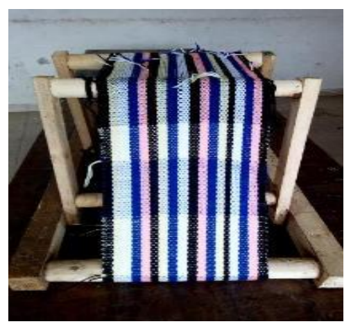
Fig. 4: Frontal view of a Warped Loom

The 2nd warp thread is wound without heddle (non-heddle warp) goes under peg B, over peg C and around peg 4 and back to peg A (Fig 5). Continue warping with these four steps alternating heddle and non-heddle threads. However, to achieve a longer woven fabric, wind warp yarn around every peg, but for shorter weave, skip some pegs. Continue the warping process in the same path by alternating heddle and non-heddle yarns. When all the warp yarns have been wrapped onto the loom, untie the beginning slip knot and tie the first heddle yarn to the end of the last warp yarn. The knotted yarns should pass around the outside of peg A.