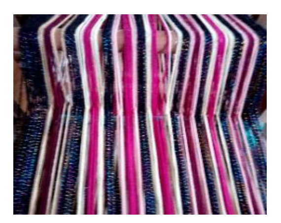
Fig. 3: A Warped the loom

The 2nd warp thread is wound without heddle (non-heddle warp) goes under peg B, over peg C and around peg 4 and back to peg A (Fig 5). Continue warping with these four steps alternating heddle and non-heddle threads. However, to achieve a longer woven fabric, wind warp yarn around every peg, but for shorter weave, skip some pegs. Continue the warping process in the same path by alternating heddle and non-heddle yarns. When all the warp yarns have been wrapped onto the loom, untie the beginning slip knot and tie the first heddle yarn to the end of the last warp yarn. The knotted yarns should pass around the outside of peg A.