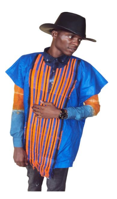
Title: Onobrakpeya Design