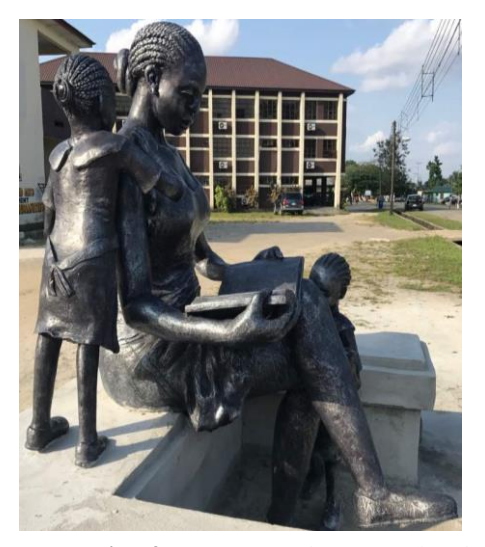
Fig. 4: Ufen nwet ketu mi Eka Ibang (Right Side View), Felix Obot Medium: Fibre glass Specification: 6 ft tall © Okagbo, Vivian, 2018.