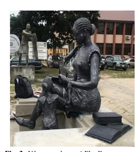
Fig. 3: Ufen nwet ketu mi Eka Ibang (Left side view), Felix Obot Medium: Fibre glass Specification: 6 ft tall © Vivian, Okagbo, 2018.

Medium: Fibre glass, Specification: 6 ft © Vivian Okagbo, 2018.