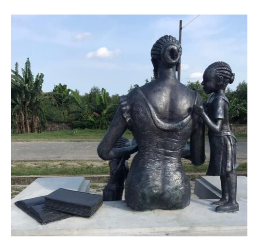
Fig.2: Ufen nwet ketu mi Eka Ibang (Back view), Felix Obot,

Medium: Fibre glass, Specification: 6 ft © Vivian Okagbo, 2018.