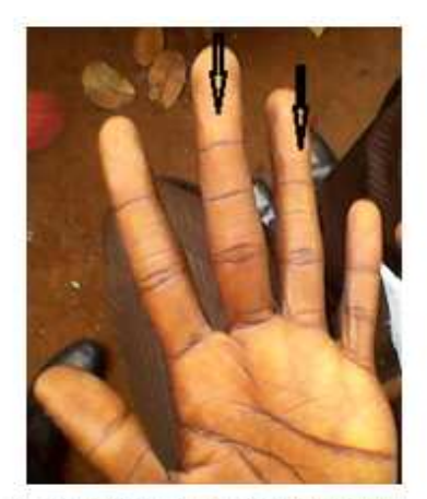
Fig. 4: showing supernumerary digital flexion crease on the middle and annularis fingers of the left palm