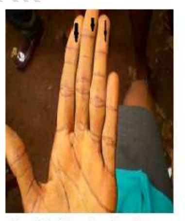
Fig. 2: Left palm showing supernumerary digital flexion crease on the index, middle and annularis fingers