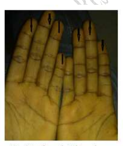
Fig. 3: Left and right palm showing supernumerary digital flexion crease presented on different fingers of the palm