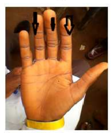
Fig. 5: Right palm showing supernumerary digital flexion crease of different pattern on the index, middle and annularis fingers.