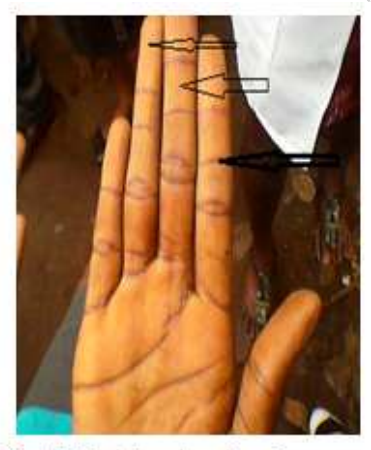
Fig. 1: Right palm showing supernumerary digital flexion crease on the index, middle and annularis fingers

Figures 1, 2, 3, 4, 5, 6 and 7 represent pictures summarizing the various variations of supernumerary digital flexion crease presented by the subjects. The arrows indicate the affected fingers.