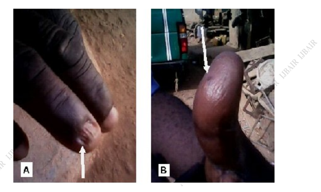
Plate 4: Fingers healed as a result of treatment with extract of Boerhavia diffusa L