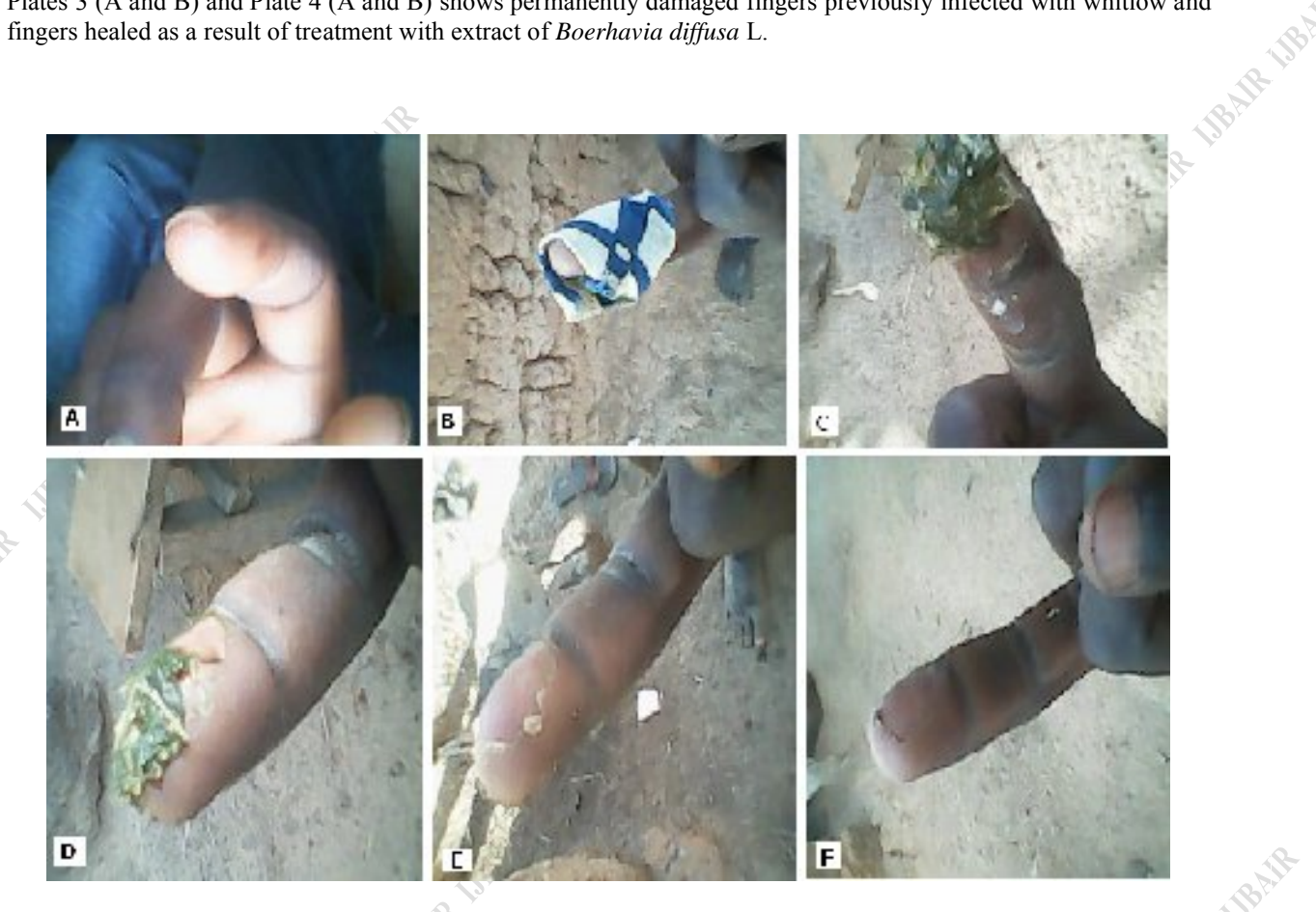
PLATE 2 (A, B, C, C, D and F): Showing healing processes following treatment with extract of Boerhavia diffusa L. Note finger at presentation with swollen pad (A); poultice of plant applied and bandaged immediately (B); addition of more extracts after three days with healing in progress (C); infected finger five days later (D); finger healing with scars seven days later (E); and finger completely healed after eight days.

A breakdown of healing processes which begins from presentation of infection through application of herbal extract to actual healing is shown in Plates 2 (A, B, C, D, E and F). The process takes from 2days to 8days in some cases. Plates 3 (A and B) and Plate 4 (A and B) shows permanently damaged fingers previously infected with whitlow and fingers healed as a result of treatment with extract of Boerhavia diffusa L.