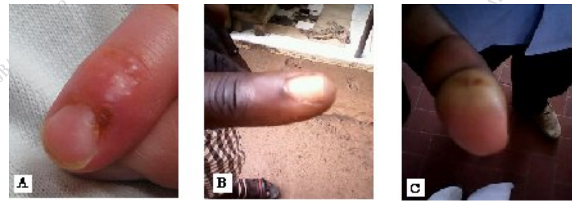
Plate 1 (A, B and C): Herpetic whitlow in a young child (A); Active clinical infection (B) (paronychia); and Active clinical infection (C) (Felon)

The causative organisms for Paronychia are bacteria and usually, staphylococcal or streptococcal organisms. Fungus rarely causes whitlow and it characteristically begins as a hangnail. Oftentimes, the affected individual would attempt to bite off the piece of nail at the corner of the fingertip. This results in an open wound that would allow bacteria on the skin or in the mouth to infect the wound (Plate 1B). The infection can then spread to the surrounding tissue next to the nail and cuticle (Rigopoulus, Larios, Gregoriou and Alevizos, 2008). Interestingly, the infection of the finger pad by same organisms causing paronychia leads to Felons , which are usually secondary to puncture wounds allowing the introduction of bacteria deep into the finger pad. The fingertip has multiple compartments with which infections can spread (Plate 1C). Other related infections include Flexor tenosynovitis caused by bacteria introduced by a penetrating trauma into the deep structures and tendon sheaths and subsequently spreading along the tendon and associated sheaths (Anderson & Erik, 1987); and Deep space infections caused by bacteria that get into the deep tissues through puncture wounds or deep cuts.