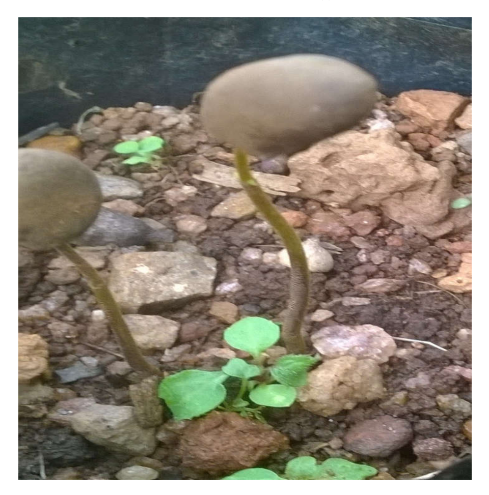
Figure 1 : Germinated Xylopia aethiopica seeds at 50 days after sowing, showing an epigeal growth which consisted of the emergence of cotyledons above the surface of the substrate as a result of hypocotyls elongation.

G. KANMEGNE et al. / Int. J. Biol. Chem. Sci. 11(2): 597-608, 2017