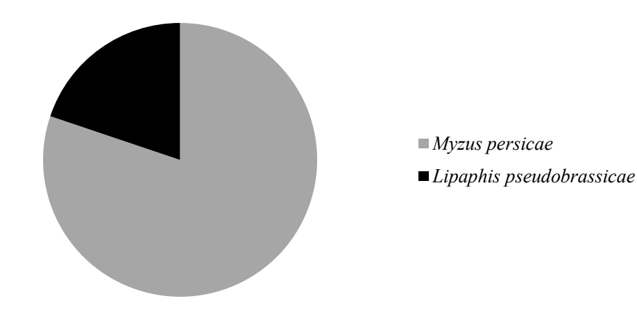
Figure 1: Abundance (%) of aphid populations sampled in Malika (Dakar).