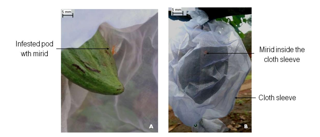
Figure 2 : Protocol of fruits infestation with mirids: A) beginning of fruits infestation with partial opening of the cloth sleeve protecting the infested fruit B) post infestation of fruit with complete closure of the cloth sleeve.