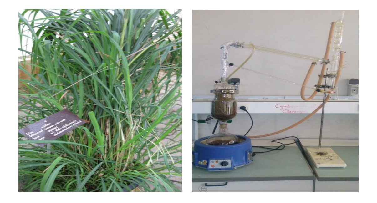
Figure 1 : Cymbopogon nardus.

This solution was prepared under conditions identical to the other solutions tested. The number of dead larvae was counted after 24 hours exposure to the different concentrations of essential oils. Larvae that remain insensitive to needling or those that are moribund are considered dead. The results of the larval sensitivity tests were expressed as a percentage of mortality as a function of the essential oil concentrations used. If the percentage of mortality in the control is greater than 5%, that of the larvae exposed to the essential oil must be corrected using the Abbott formula: % death = [(Test-Control) / Witness] \times 100 (Carballo et al., 2002). If the mortality in the controls exceeds 20%, the test is invalid and must be repeated. The statistical analysis of our data was performed using the GRAPH PAD PRISM 7.0 software, in order to highlight the mortality rate of Anophelesgambiae larvae according to the concentrations used and the estimation of the lethal concentrations 50 and 90 (LC<sub>50</sub> and LC_{90} ) was made using the same software.