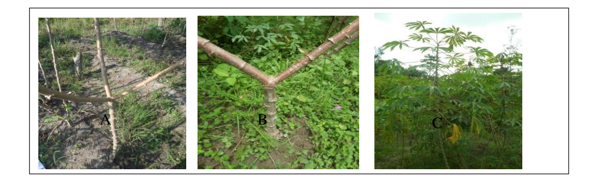
Figure 3: Types of branching (A: Trichotomous, B: Dichotomous, C: Unbranched)