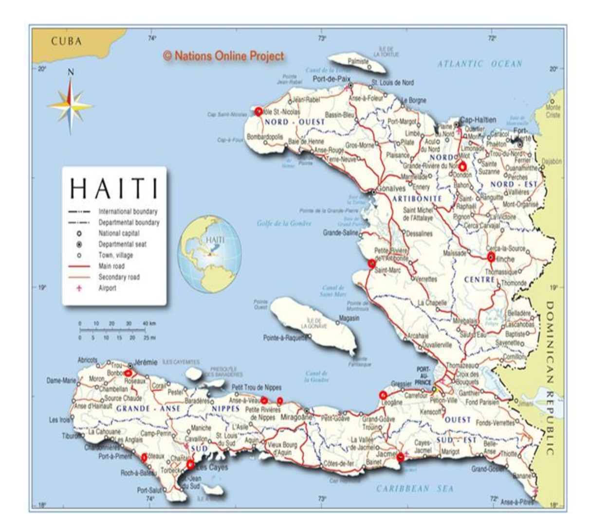
Figure 1: Administrative map of Haiti with red points indicating the origin of the sampled taro accessions.

tests, prior analysis of variance (ANOVA). A two-way ANOVA was carried out using sites, genotypes and sites x genotypes as fixed and the Ryan-Einot-Gabriel-Welsch-F test (REGW-F) was used to detect significant differences among means (Assa et al., 2012). Pearson's rank correlation coefficients (p) were computed for all recorded traits and the obtained results were used to build a correlation matrix. Similarity among taro was checked with cultivars Clustering Analysis (CA) using Hierarchical Cluster Method based on Euclidean distance (Crossa and Franco, 2004; Oladipo and Illoh, 2010).