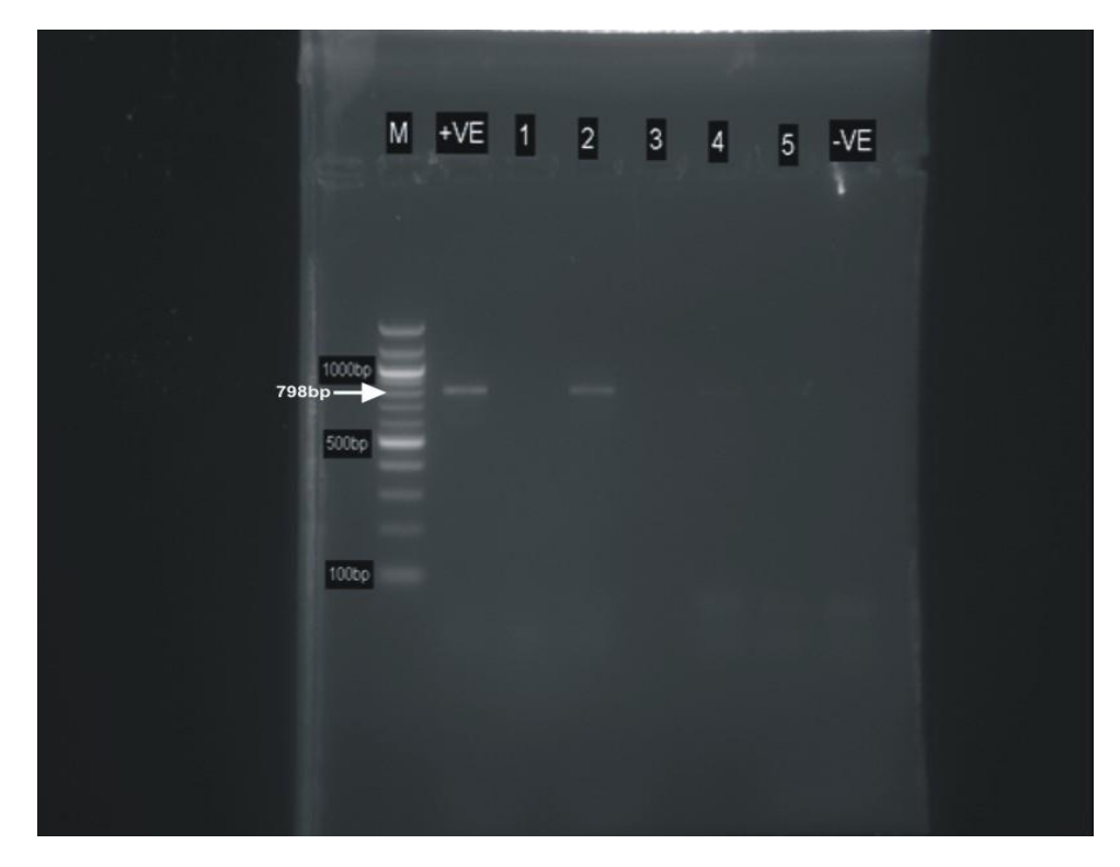
Plate 2: Amplification of Pfatpase-6 gene @ 798bp from DNA of P. falciparum infected patients in two hospitals in Kaduna, Nigeria.