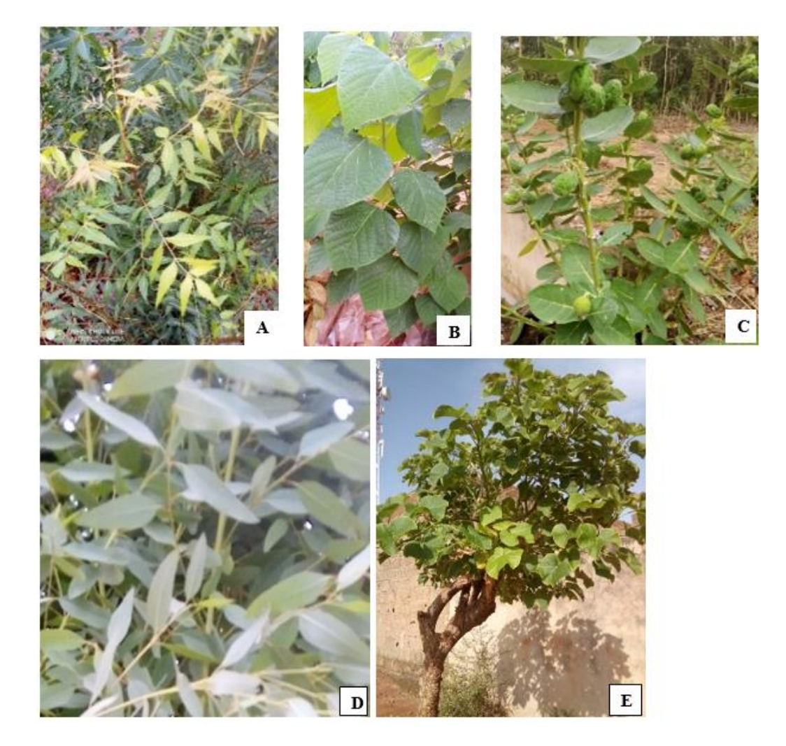
Figure 1: Photographs of the five selected medicinal plants in the field when leaves were collected. (A: A. indica; B : G. arborae; C : C. procera; D : E. camaldulensis; E : J. curcas ).

The Excel 2013 spreadsheet was used for data entry and organization. Experimental data were analysed using R software version 3.6.2. The extracts of the five plant species were compared to each other in pairs and to the controls using the Wilcox test. This test made it possible to verify if there are significant differences between the different treatments in the inhibition of mycelial growth of the two species of Lasiodiplodia at the probability level of P <0.05.