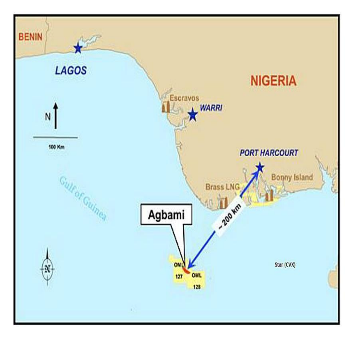
Figure 3: Map of study site.

Information from JNCC record of Sighting forms were analyzed using descriptive statistics, correlation and Analysis of variance (ANOVA) at p=0.05.