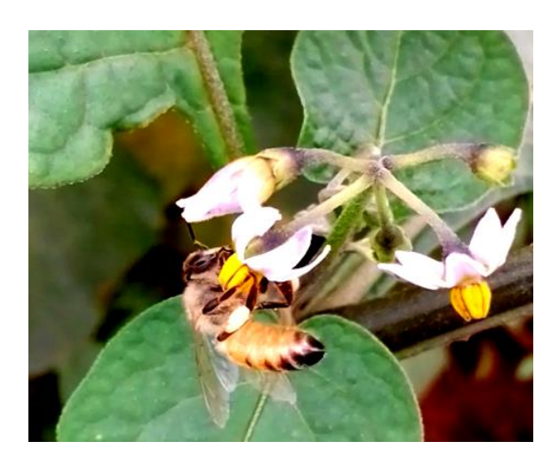
Figure 1: Apis mellifera worker collecting pollen from a Solanum nigrum flower at Meskine in 2019.