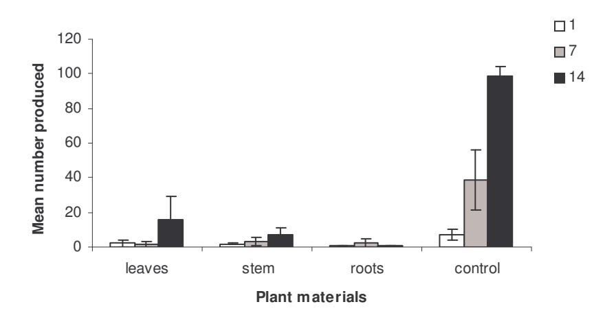
Figure 1: Mean number of C. maculatus adults produced in cowpea treated with Z. xanthoxyloides extracts at different times after oviposition period.