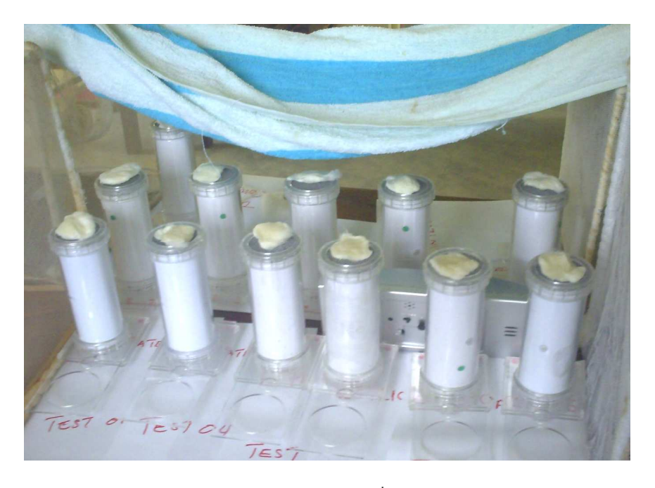
Figure 3: Our 24-hour holding process on 21^{st} - 22^{nd} October 2009.