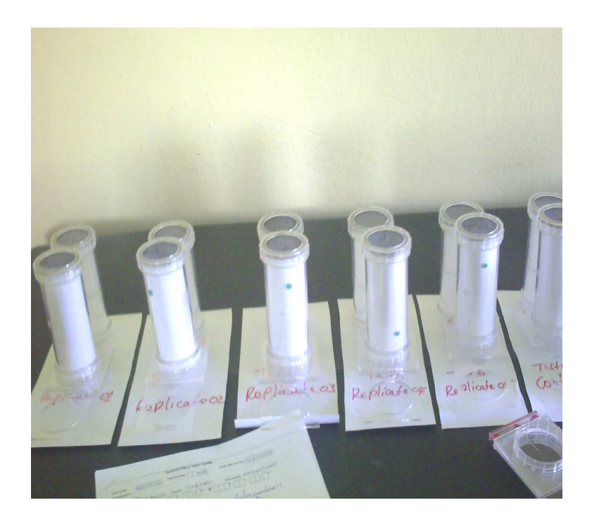
Figure 2: The susceptibility/vector resistance study tubes of our work on 21<sup>st</sup> Oct 2009.

G. S. BIMENYA et al. / Int. J. Biol. Chem. Sci. 4(3): 657-668, 2010