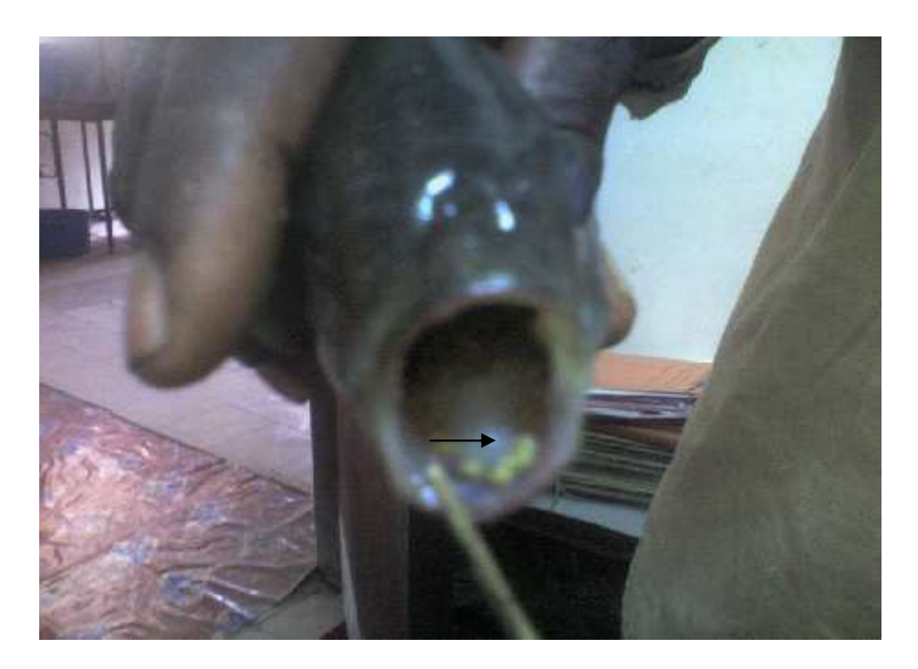
Figure 1: Oreochromis niloticus Female brooding eggs in its mouth (December, 2007). → Indicates Egg.