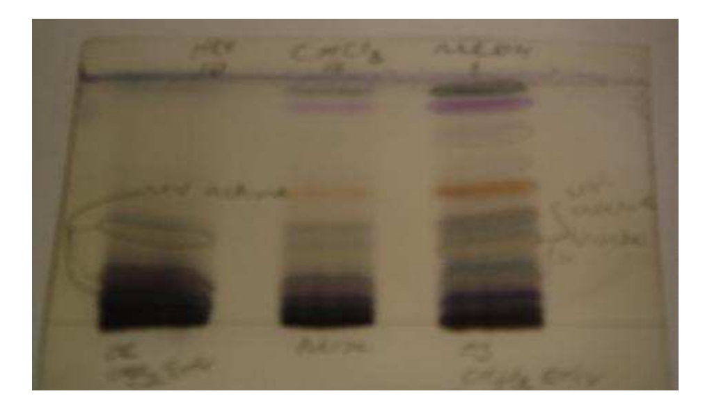
Figure 3: TLC of O. gratissimum extracts with vanilin -H<sub>2</sub>SO<sub>4</sub> spray showing the active bands.