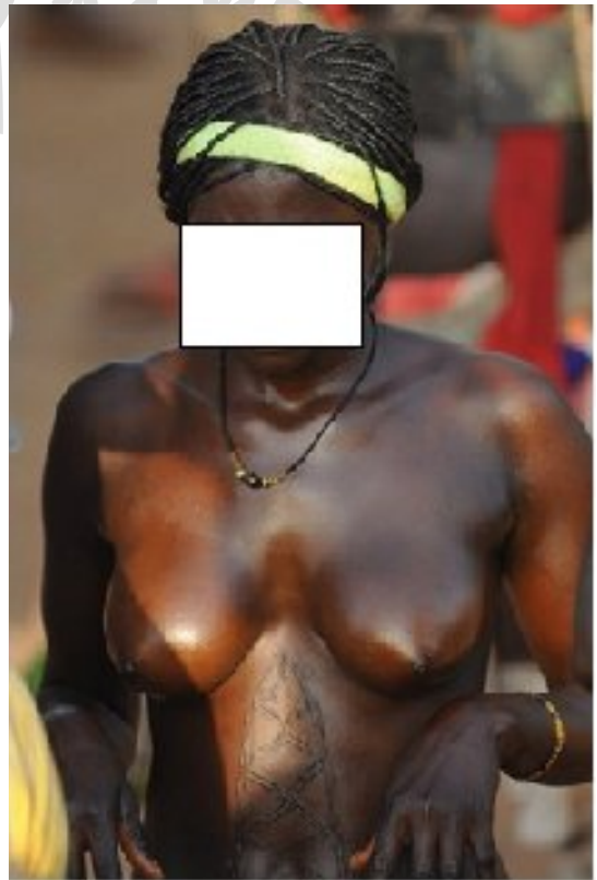
Fig 3: A young Guinea Bissau lady depicting the ancient form nudity

Obviously, the world at large is turning around as dress code has become a controversial issue. Despite the saying "Dress the way you want to be addressed", youths are no longer interested about the impression their mode of dressing leaves in the minds of the public; so long as they are satisfied with their looks. They believe that whatever they are wearing does not