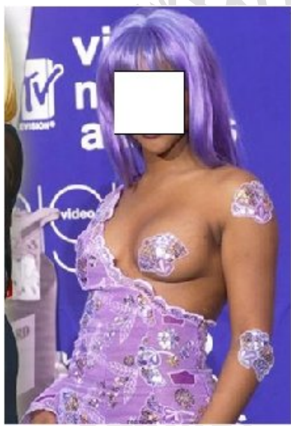
Fig 2: A celebrity attending a music award ceremony depicting modern day form of nudity

As the saying goes, what goes around comes around. It is rather interesting that the nakedness of the ancient times seem to have been reenacted by the so-called 'celebrity nude fashion trend'. Well known celebrities now appear naked in the full glare of cameras and the viewing world; all in the name of fashion. Unfortunately, their roles in the entertainment world make them role models and in this regard, their fans copy their way of life. Consequent upon this, clothing and dress pattern is headed back to the time of Adam and Eve; with a lot of young people craving for absolute nudity.