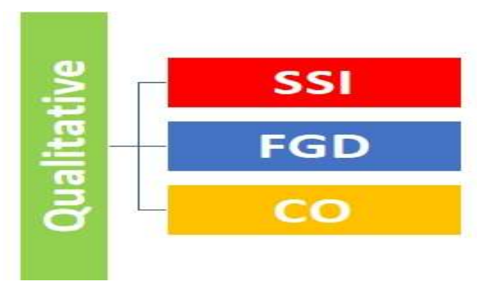
Figure 3: Instrument of qualitative approach.

This study adopts a qualitative approach which refers to an in-depth descriptive study of the phenomenon (Creswell, 2006) with data drawn from interviews, focus group discussions, and field notes.