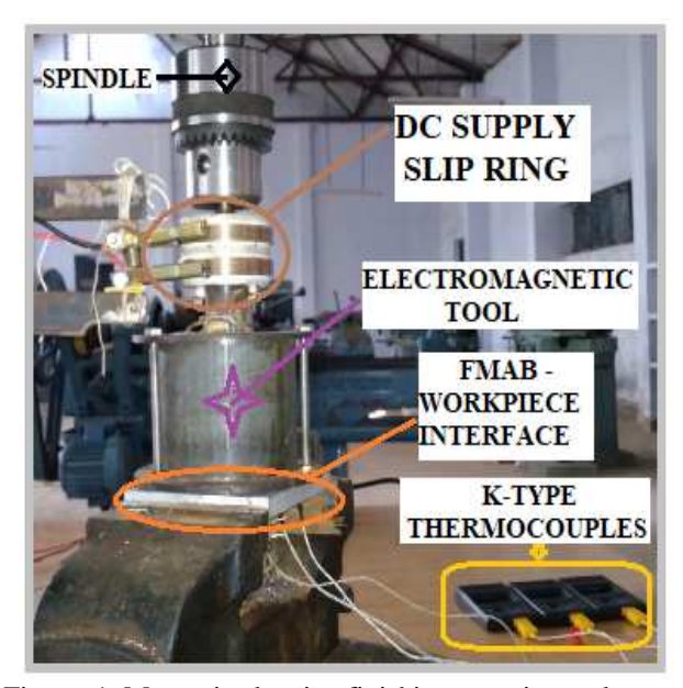
Figure. 1. Magnetic abrasive finishing experimental set-up

Then, Surface temperature experiments of EN-31 were conducted using the MAF process shown in figure (1) to access the Increase in temperature. At first pilot experiments were performed to study the preliminary behavior of the MAF process. While performing pilot surface temperature experiments, it was seen that an increase in surface temperature had become constant approximately after 20 minutes and main surface temperature experiments were carried out for 20 minutes only. After that, Taguchi L9 orthogonal array was applied for systematic experiments. A total of nine experiments was conducted using different processing conditions shown in table 3. The experimental results showed the maximum surface temperature in EN-31 was found to be 41° C with respect to the ambient temperature of 23 ^{\circ} C. Table 4 shows the 'Increase in Temperature' ( \Delta T) during the finishing of EN-31 for all experiments.